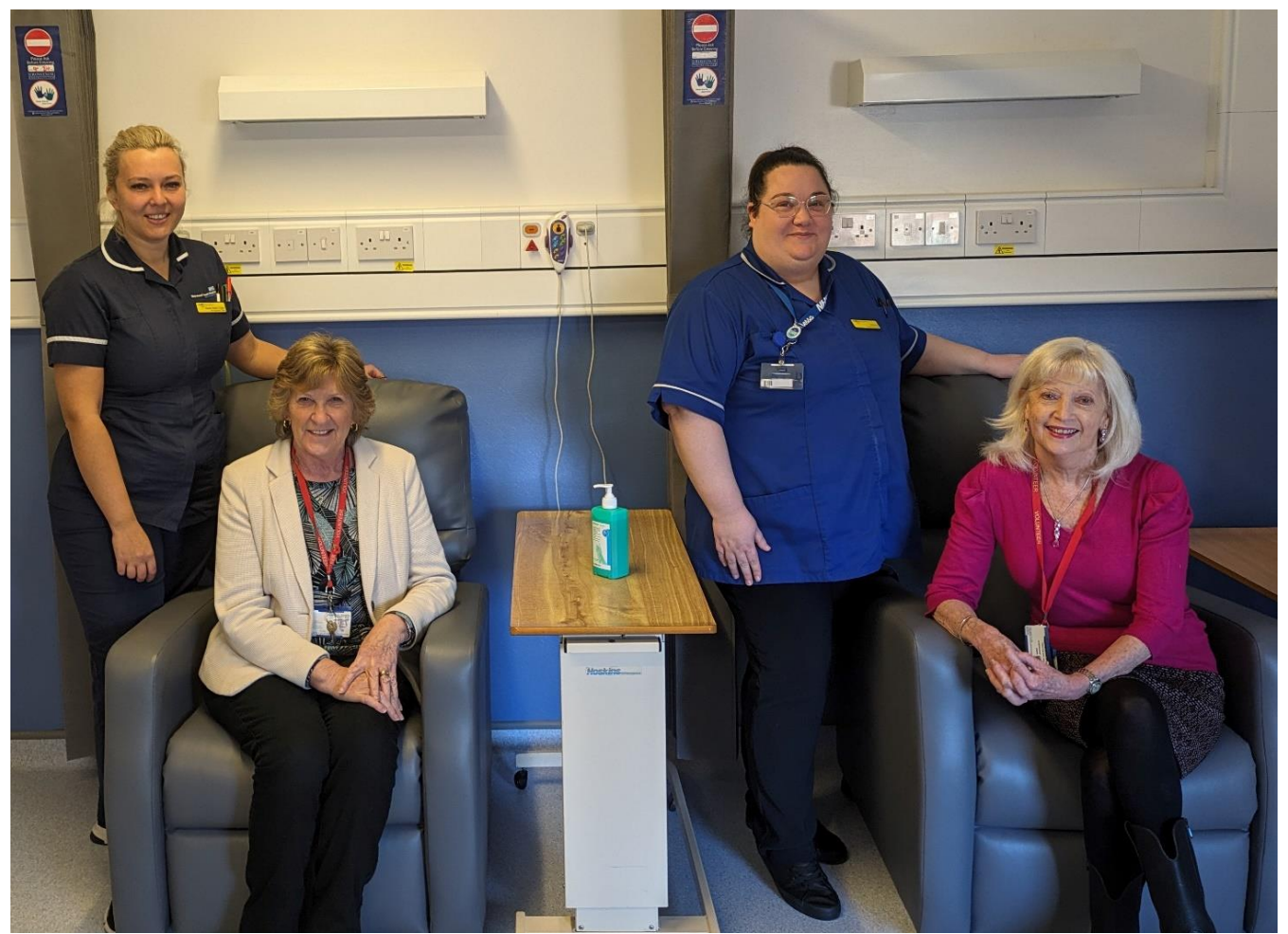
Caption: Four recliners chairs are presented to Newark Hospital's Minster Ward

Other notable developments from our brilliant Community Involvement team and our team of volunteers during the month include: