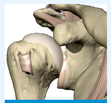
Front view of the right shoulder

Together this ball and socket form your shoulder joint. With the reverse shoulder replacement, the anatomy or structure of your healthy shoulder is reversed (your ball and socket are swapped over). This can improve the pain and function of your shoulder.