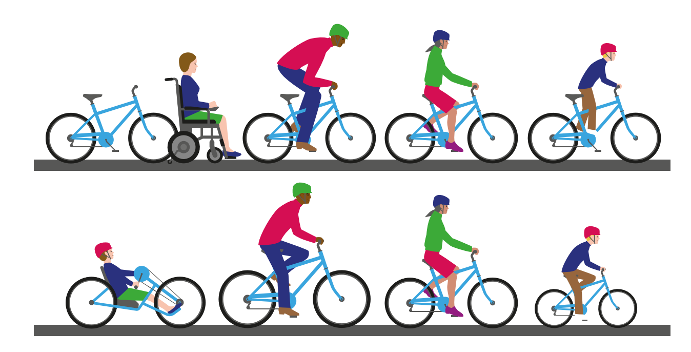
Figure 5: The difference between equality and equity.

Equity has been adopted as a core guiding principle of the ICS, recognising that a 'one size fits all' method for what we do across health and care can create barriers and exclude certain groups of people, ultimately impacting on the needs of the population and demand across the system.