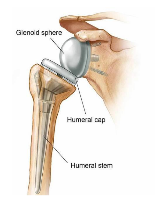
Right shoulder from the front