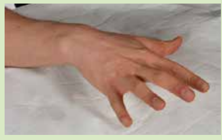
Open and close hand your gently as comfort allows.

You should do your exercises in this order at least twice a day at home, until your follow-up physiotherapy appointment. They can then be altered or increased under the guidance of your physiotherapist.