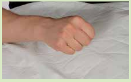
You can also rotate the wrist in a circle so it does not get too stiff.